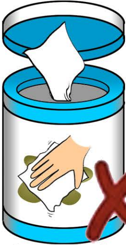
Disinfecting or Cleaning Wipes

Never flush any kind of wipes, including: