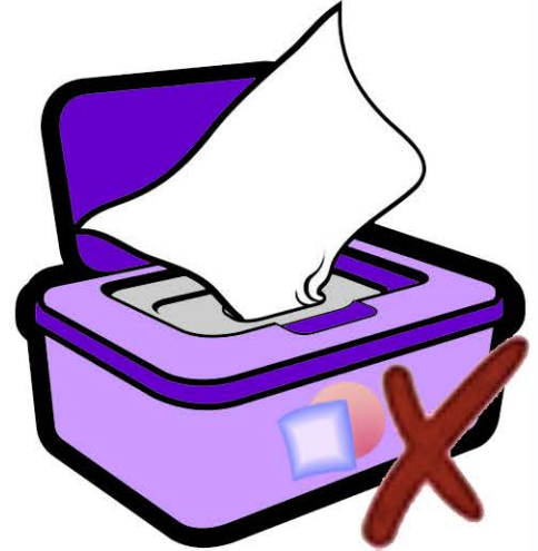
Makeup Remover Wipes