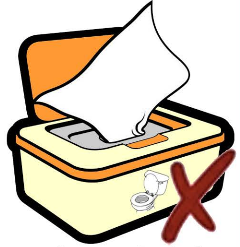
Wipes Labeled "Flushable"