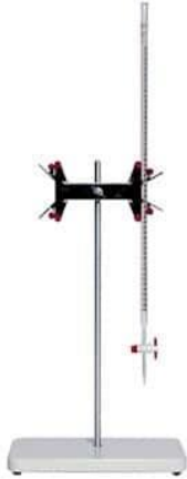
Support, Burette and Burette Clamp

FLASKS. Flasks are used for containing and mixing chemicals. There are