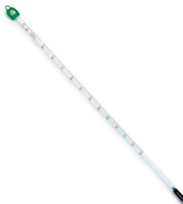
NIST Traceable Lab Thermometer