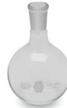
Flat Bottom Flask