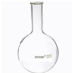
Boiling Round Bottom Flask