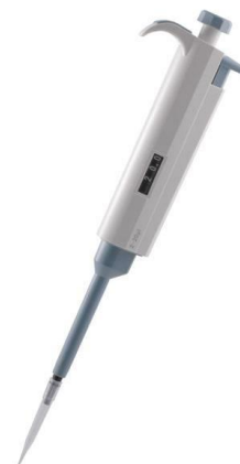
Adjustable Volumetric Pipette