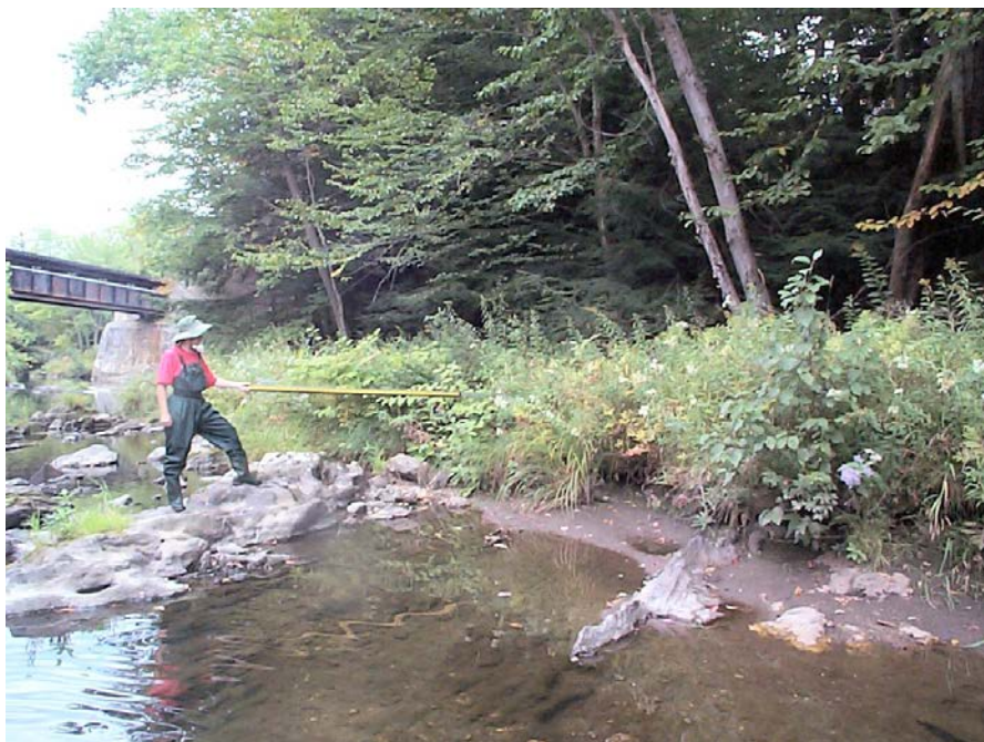
Figure 3 Close up of Figure 2. Survey rod shows slope (nearly flat) of the lateral bar surface.