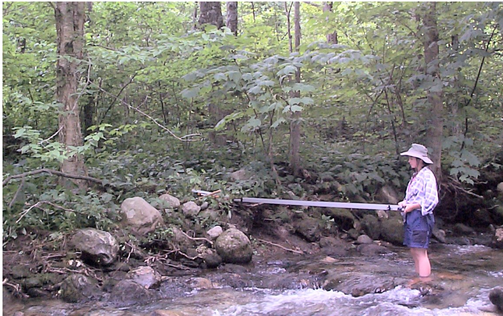
Figure 7 Example of a well developed floodplain in a system characterized by boulder size boundary material.