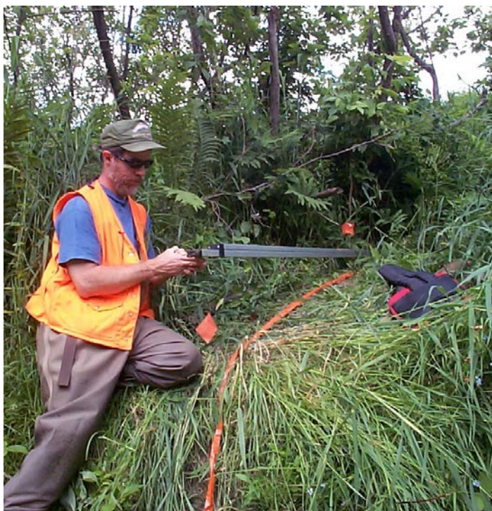
Figure 4 Lateral bar indicating bankfull stage. Note that the upslope flag is location of bankfull stage. At this location the slope of the bar surface becomes nearly flat. Also note the woody vegetation line at that point.