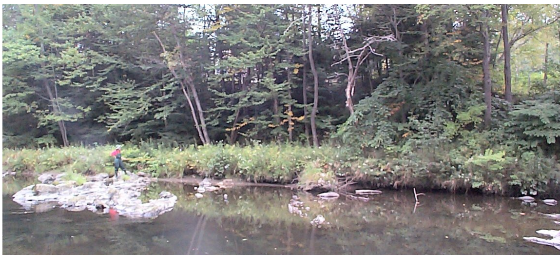
Figure 2 Well developed lateral bar indicating bankfull stage.