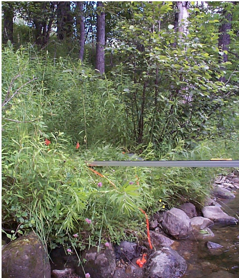
Figure 6 Bench feature indicating bankfull. Survey rod shows the slope of the bench surface.