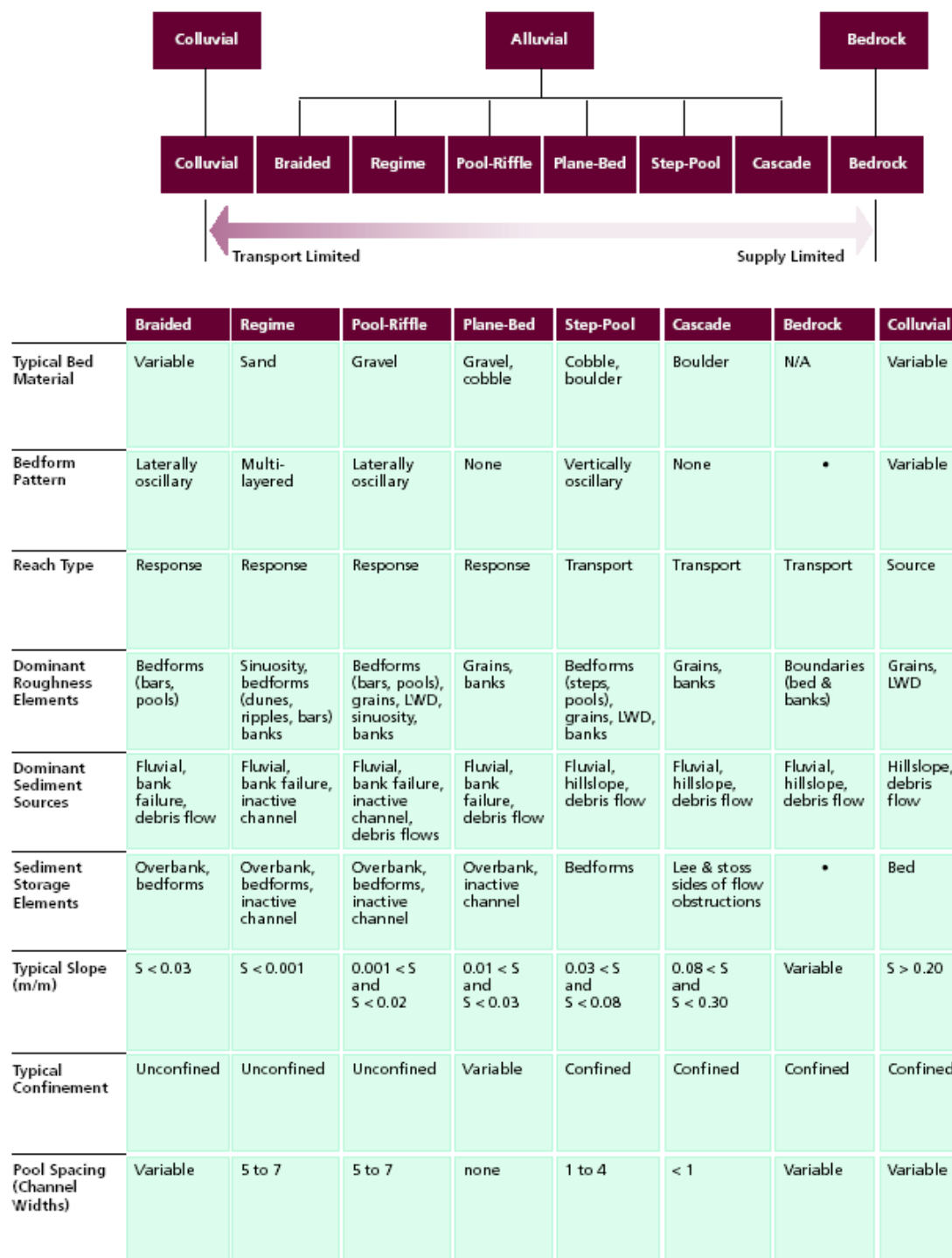
Figure 2. Suggested stream classifications for Pacific Northwest. Source: Montgomery and Buffington 1993. Table excerpted from the Federal Interagency Stream Restoration Working Group. 1998. Stream Corridor Restoration Manual: Principles, Processes, and Practices.