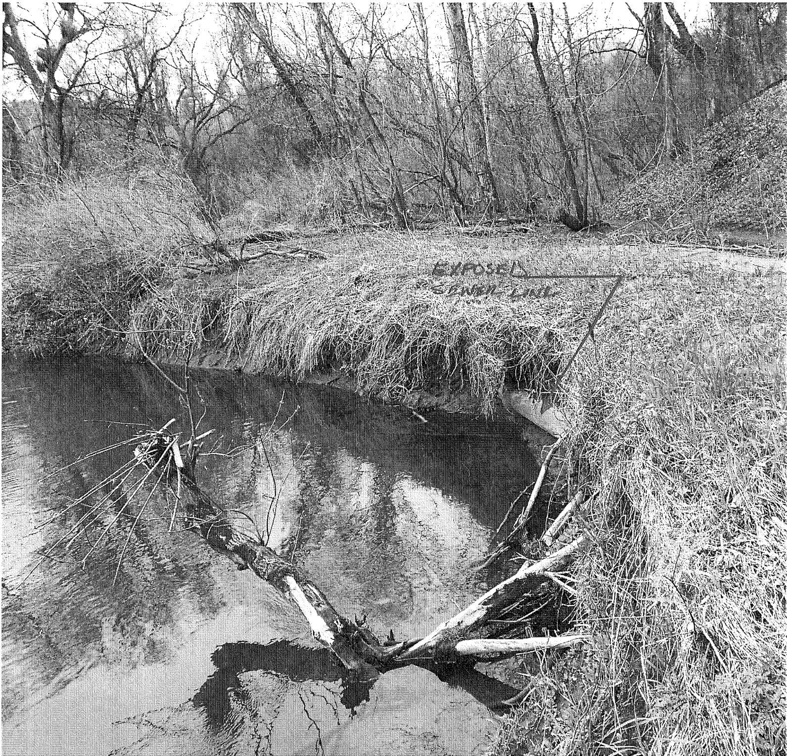
BARRE TOWN EXPOSED $