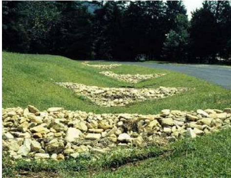
Stone check dams slow the flow of water.

TECHNICAL ASSISTANCE For help designing or maintaining ditches, please contact the Vermont Clean Water Initiative at 802-828-1535.