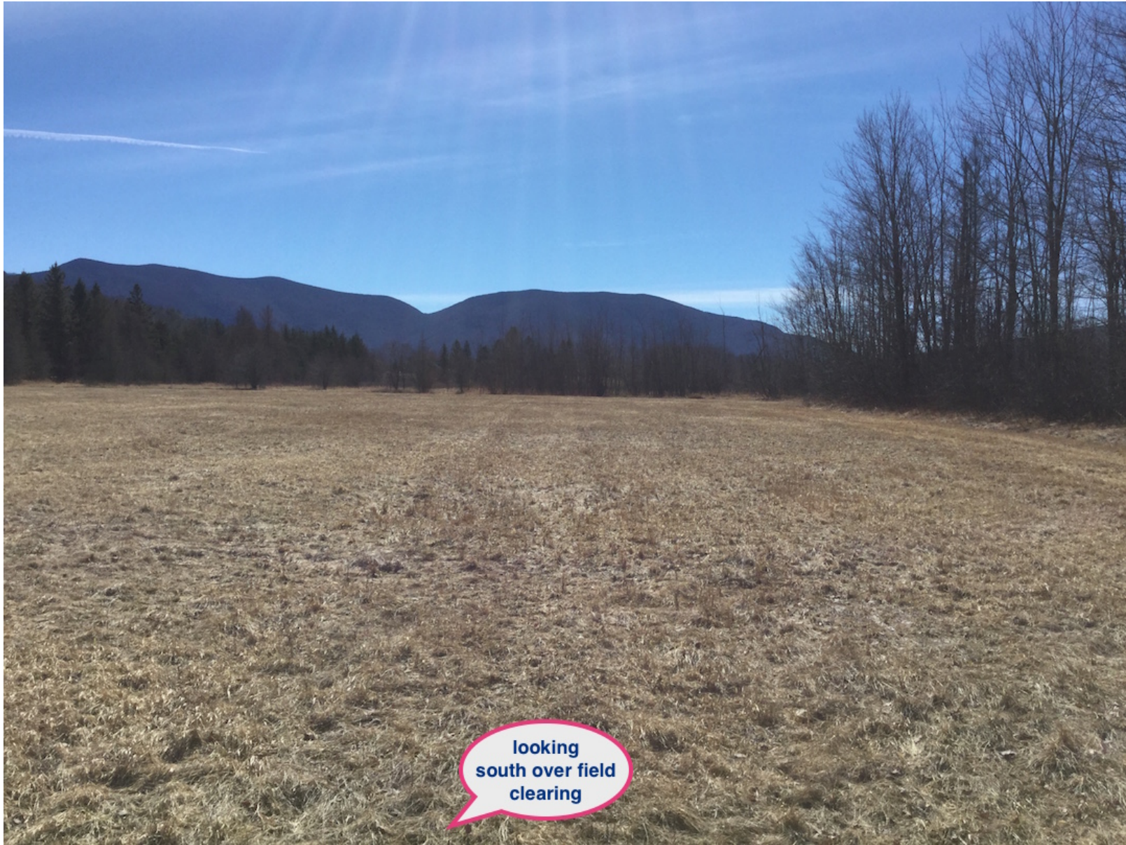
looking south over field clearing