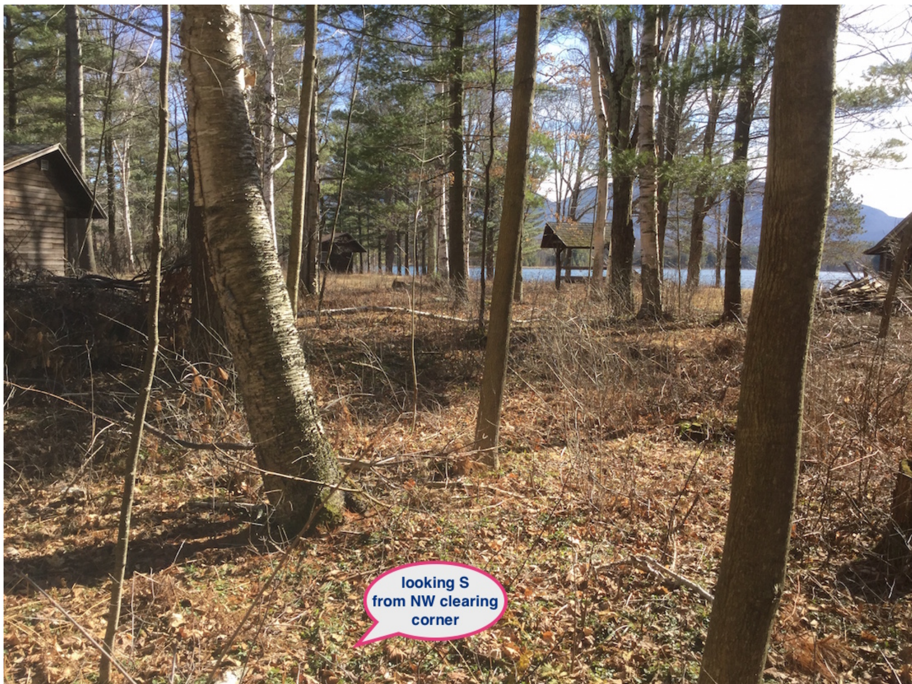
looking S from NW clearing corner