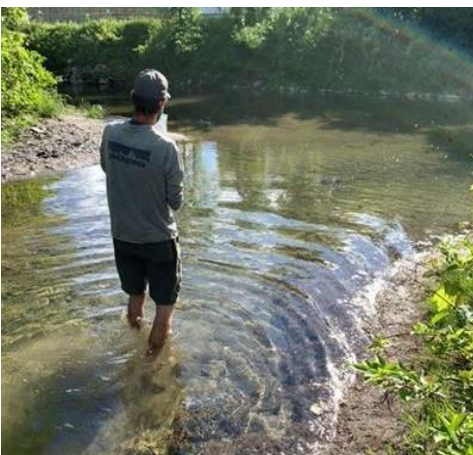
Friends of the Winooski River 4 Rivers Partnership sampling in Barre

Please submit any outstanding flow observations. Flow observations are essential to the data review process. Without flow observations, your data cannot be reviewed or uploaded into IWIS. Delays in flow observation submission will lead to delays in data review and approval.