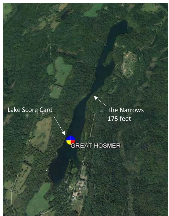
Figure 2. The Narrows are less than 200 feet wide. For a description of the "Lake Score Card," see separate fact sheet on "Shoreland Condition." Image from the <u>Vermont Lake Score Card</u> (Google Earth).