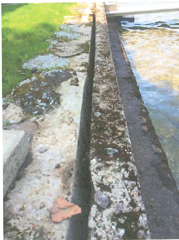
Picture of east end showing wall separation