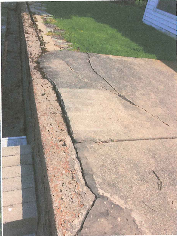
Picture showing wall separating