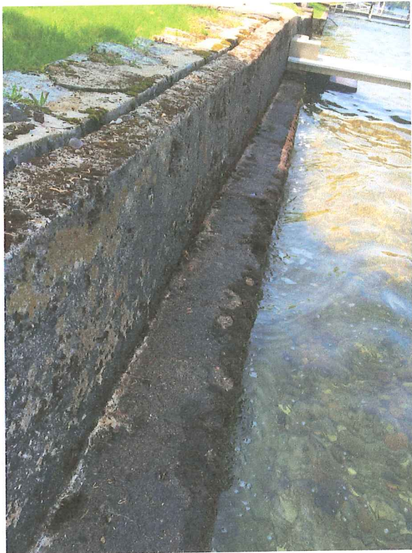
Picture showing overall condition of wall