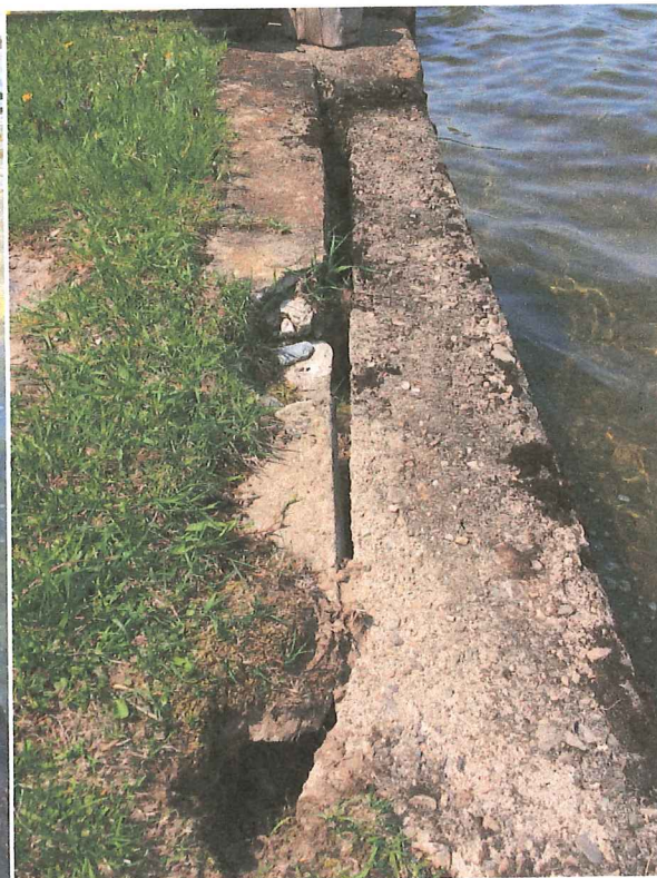
Picture of west showing separation and cracking