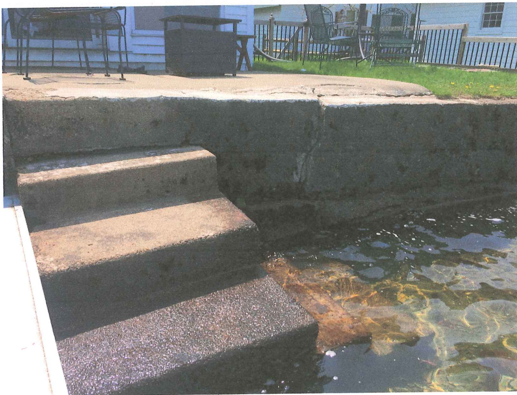
Picture showing stairs that are now leaning and moving