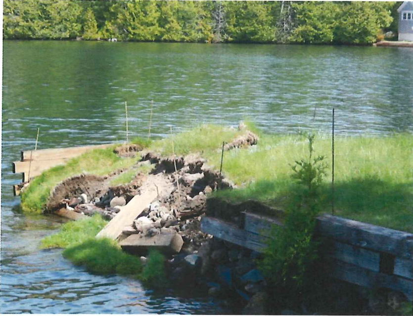
Damaged area-South side