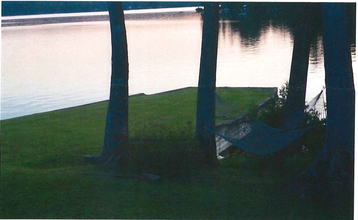
Pre Damage appearance