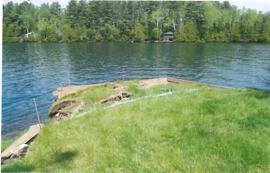
Approximate line of new end of grassy area of dock