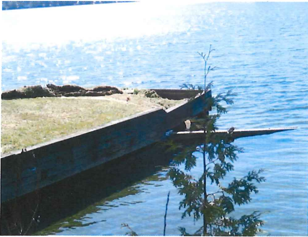
North side of dock