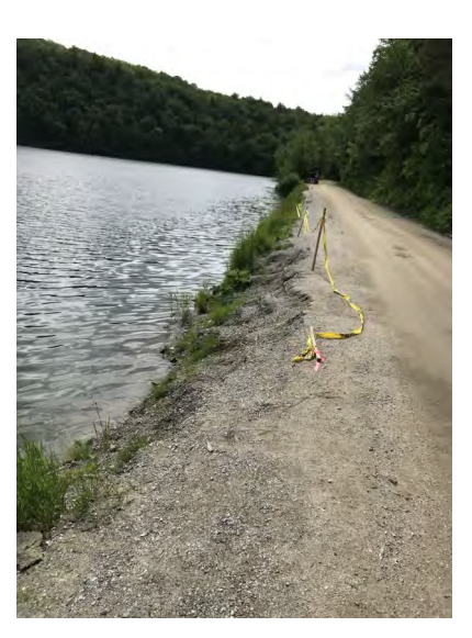
August 2019 Black Pond Road

This project is funded through VTRANS Better Roads Program and contractors, environmental engineers, designers and consultants are invited to participate in this field training opportunity. Although the work will continue for a week to complete, Wednesday, September 11th is the hands-on training day and chance to learn from local experts in bioengineering. Come join us or stop by if you can.