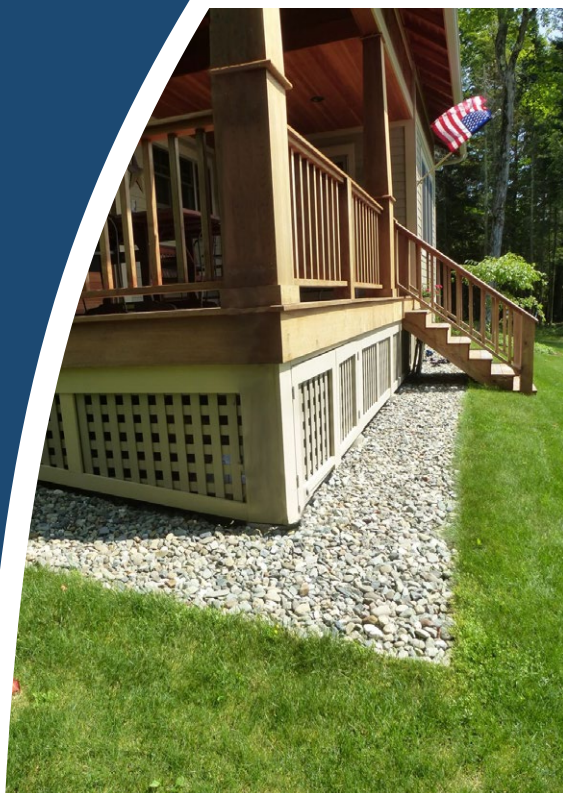
A dripline trench infiltrates roof runoff.

Description. An infiltration trench is a stone-lined shallow channel that collects and infiltrates stormwater runoff from developed areas including walkways, driveways, parking lots, and roofs.