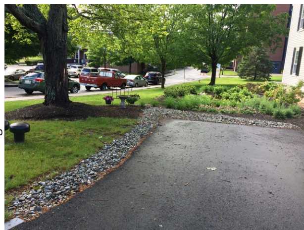
Driveway infiltration trench stops erosion.

Description. An infiltration trench is a stone-lined shallow channel that collects and infiltrates stormwater runoff from developed areas including walkways, driveways, parking lots, and roofs.