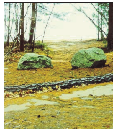
Waterbar installed along a path to prevent runoff into the lake.