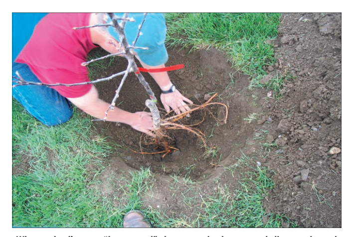
When planting a "bare root" tree or shrub, spread the roots out carefully and fill in soil by hand, pressing gently but firmly to avoid leaving air holes. Mulch around the newly planted tree or shrub to keep competition down while it gets established. Don't pile up the mulch around the stem. The mulch should be shallow right at stem so that the correct ground level is maintained.