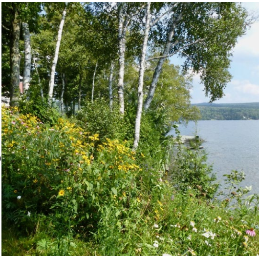
VT Lake Wise Program

An undisturbed or restored natural area consisting of native vegetation and uncompacted soil that separates and buffers the lakeshore from developed land surfaces. Vegetated buffers are appropriate for all lakeshores whether erosion is occurring or not. Buffers should be as wide as possible, ideally 50 feet to 100 feet wide, but a minimum of 15 feet is required for adequate root structure to stabilize a lakeshore. For sloped banks, the buffer should extend at least 15 feet back from the top of the bank. Wider buffers increase water quality and wildlife habitat benefits. A 100 foot buffer is required under the Shoreland Protection Act for new development. See Lakeshore Buffers for more information.