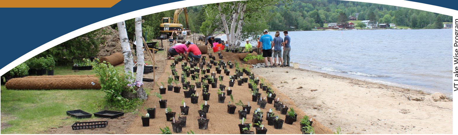
VT Lake Wise Program