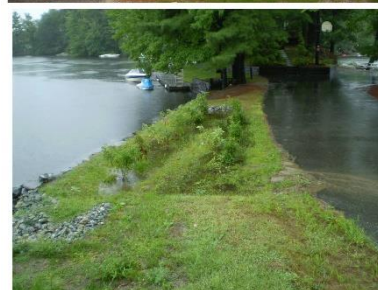
Vegetative swale with rock check dam treats 98% of road runoff to lake