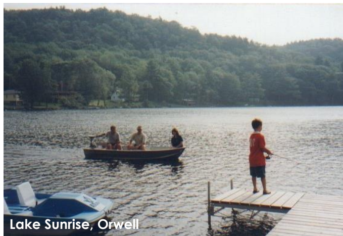
Lake Sunrise, Orwell

A LWAP is an investigation into potential threats to the lake’s ecosystem health, and the process should be participatory with the lake association or similar local organizations, lake users, shoreland owners, the Town, and other stakeholders or interested groups and people. A LWAP Final Report will also include a list of prioritized problems and solutions as well as provide a table of projects. This prioritized list of projects and strategies is intended to address the sources of pollution and habitat degradation identified in the assessment, with some of these projects benefitting from preliminary ecological and conceptual design work as part of the LWAP development process. The prioritized list of projects will be added to the DEC Watershed Projects Database and be considered for funding under the Clean Water Initiative Program (CWIP) and other sources. Given CWIP’s focus on meeting water quality restoration targets, often contained in Total Maximum Daily Load (TMDL) Phosphorus Reduction Plans, a project must have a primary objective of water quality improvement if it is to be considered for CWIP funding. The LWAP may also contain recommendations to preserve natural features and functions of a lake and its watershed, encourage use of low impact green stormwater infrastructure, and maintain the aesthetic and recreational uses of lakes.