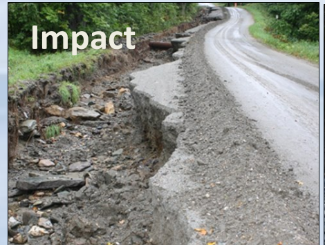
Eroding roadside ditch

This factsheet summarizes actions to reduce road-related sources of phosphorus. See Factsheet #2 for information on reducing phosphorus pollution from stormwater runoff from all other impervious surfaces, such as parking lots. See other factsheets that describe actions to reduce phosphorus from other sources.