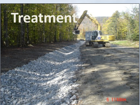
Ditch stabilization saves road repairs and reduces erosion