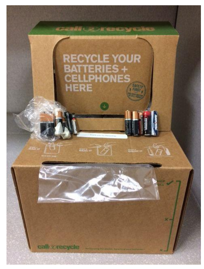
Program Collection Box

Vermont implemented its first battery stewardship program in 1991 for certain dry cell batteries including nickel cadmium, sealed lead acid and mercuric oxide batteries that are used for industrial, governmental or medical purposes. Shortly thereafter in 1994 a battery deposit program for all lead acid batteries from cars, trucks and boats including personal use was implemented. This battery deposit program allows consumers to recycle batteries at various retailers. It has made lead acid batteries the most recycled consumer product and has a national recycling capture rate of 99 %<sup>2</sup>. Other battery recycling programs have been phased in over the past 20 years for the various types of batteries in use. In 2014, Vermont became the first state to require manufacturers to fund recycling of single-use batteries, with the passage of the Vermont Primary Battery Stewardship Program. The law requires producers of primary batteries (non-rechargeable batteries) sold in Vermont to register with Vermont Department of Environmental Conservation (DEC) and provide a stewardship plan to manage the proper recycling and/or disposal of primary batteries. A Primary Battery is a non-rechargeable battery weighing