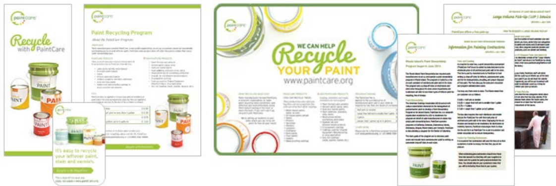
Brochure, Mini Card, Program Poster, Counter Mat, Painting Contractor Fact Sheet, LVP Service Fact Sheet

PaintCare has developed these print materials to promote the program and will continue to distribute them for use by paint retailers, other types of drop-off sites, and others (e.g., government offices, real estate agents). Illustrations of these materials are shown here: