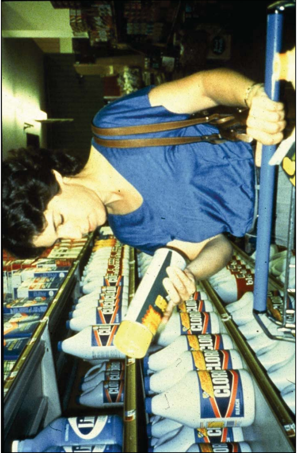
ELL Slide 2.1C