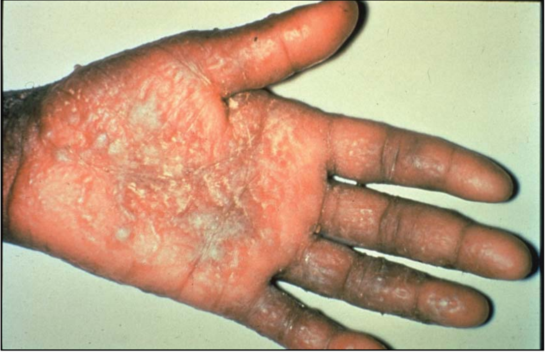
Chemical Burn Alkaline2.