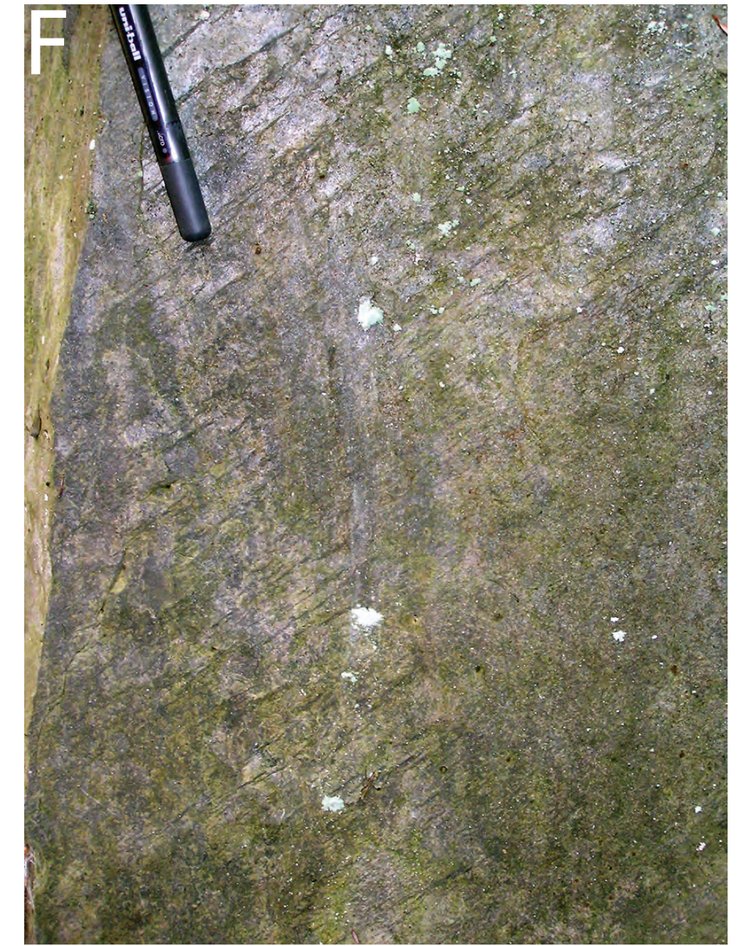
Taconian (Ordovician) L1 stretching lineations (parallel to pen) that are overprinted by Acadian (Devonian) L2 crenulation lineations (plunging gently to the left) in argillaceous quartzites of the Cheshire Formation (Cc).