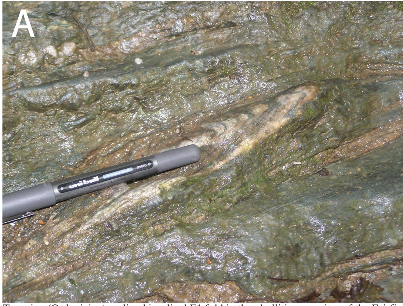
Taconian (Ordovician) reclined isoclinal F1 fold in the phyllitic quartzites of the Fairfield Pond Formation (CZfp).