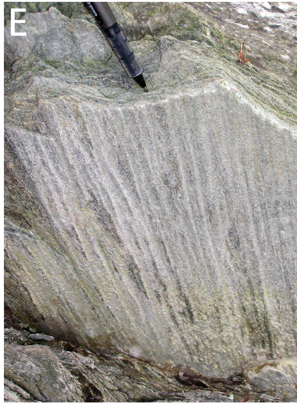
Taconian (Ordovician) L1 intersection lineation that is colinear with F1 fold axes in interlayered dolomitic marbles and phyllitic quartzites of the Forestdale member (CZpuf) of the Pinnacle Formation.