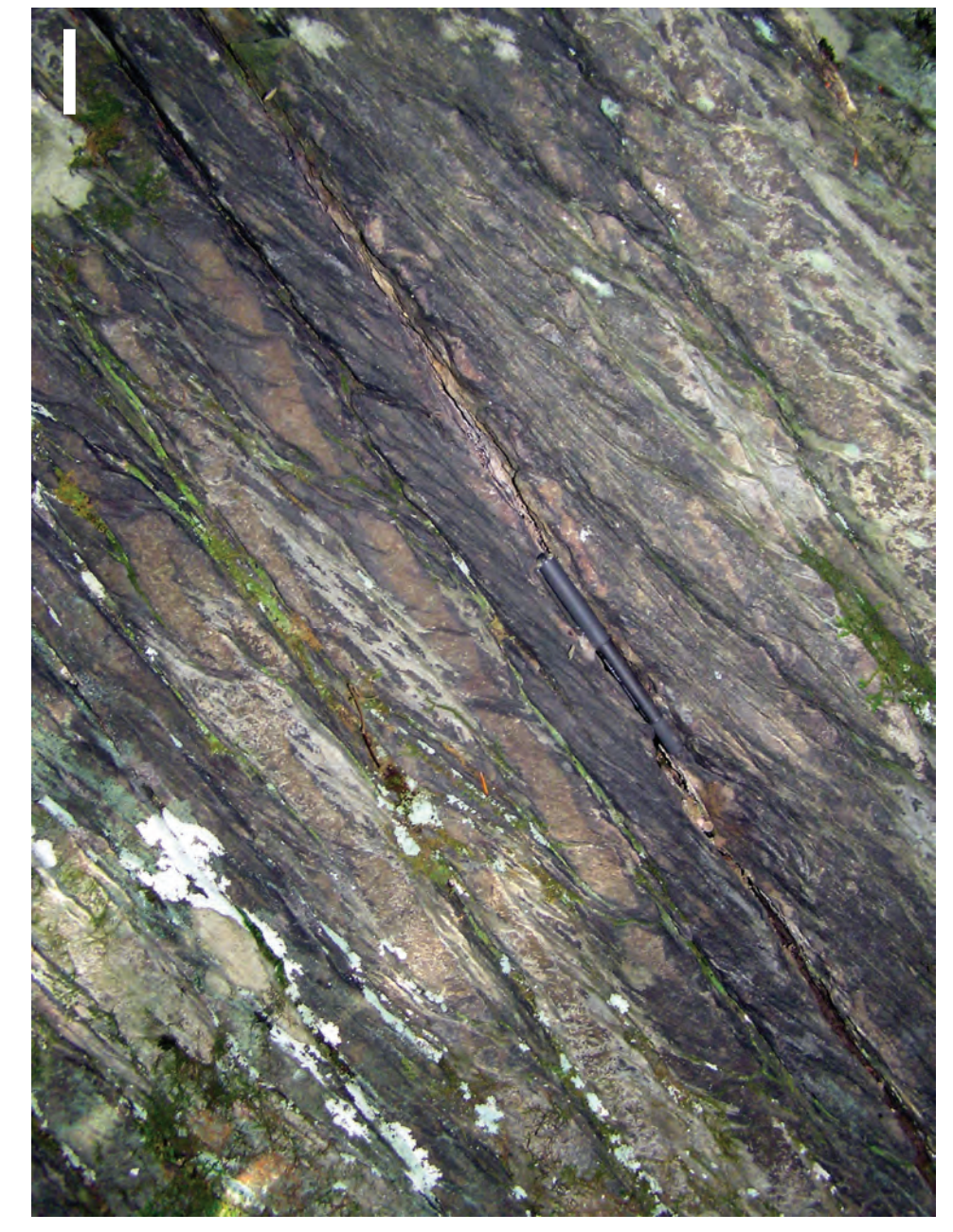
Acadian (Devonian) S2 foliation (parallel to pen) that overprints the Taconian S1 foliation (oblique to pen) in quartzites of the Cheshire Formation (Cc).