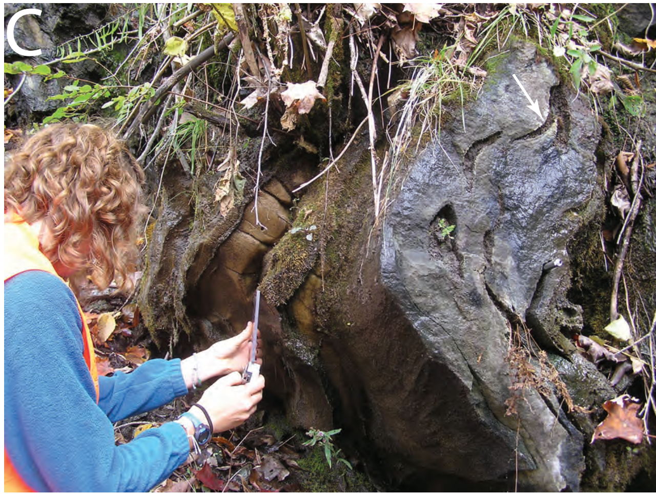
Vestiges of Taconian F1 isoclinal folds (arrow) that are deformed by asymmetric west-verging open-tight F2 Acadian (Devonian) folds in interlayered dolomitic marbles and phyllitic quartzites of the Forestdale member (CZpuf) of the Pinnacle Formation.