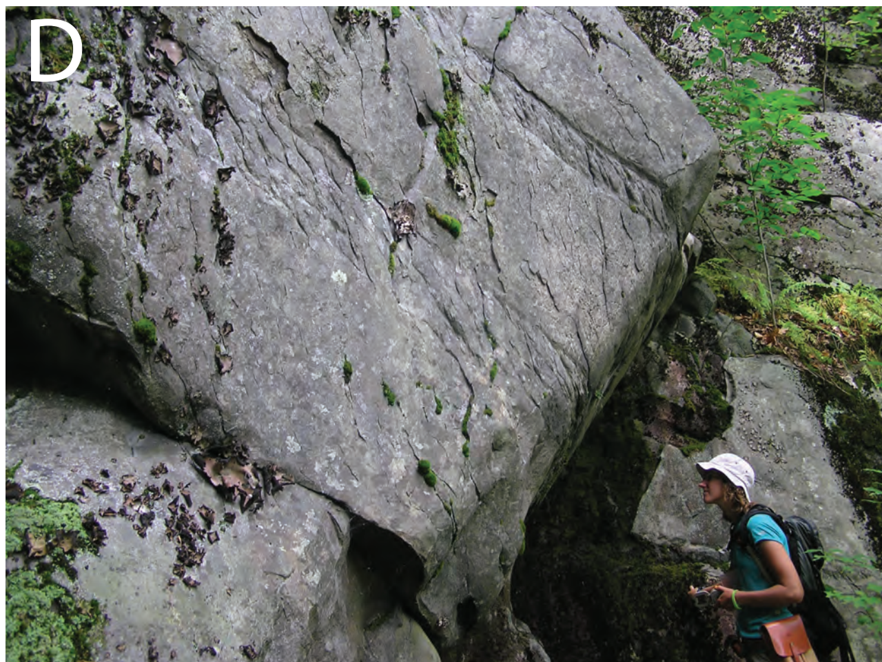
Bedding-parallel asymmetric shear bands of uncertain age in massive quartzites of the Cheshire Formation (Cc). The preferred interpretation is that they were formed by flexural slip during F2 Acadian (Devonian) kilometer-scale folding. Relative motion is top-to-the-left (west).