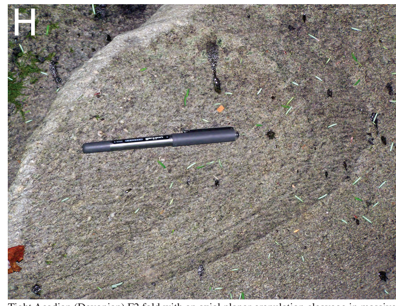
Tight Acadian (Devonian) F2 fold with an axial planar crenulation cleavage in massive metawackes of the Pinnacle Formation (CZpw).