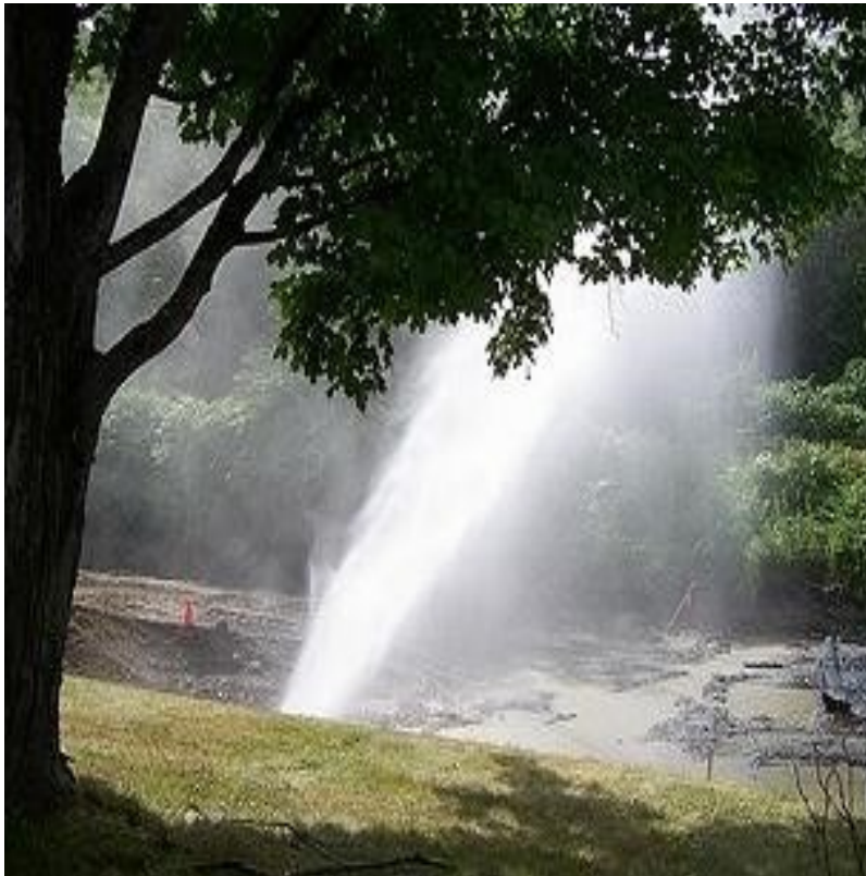
Water main break in Montpelier, VT (August 2011)

Check out the Asset Management Guidance and Grant opportunity on our website. The guidance includes information on: