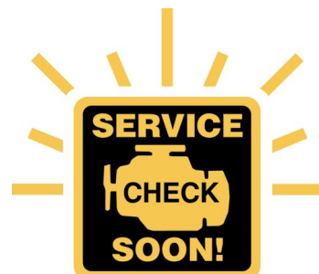
Malfunction Indicator Light

system parts, including the computer or engine control unit, the catalytic converter, most electronic sensors and control devices, and some transmission and chassis parts are considered emissions-related.