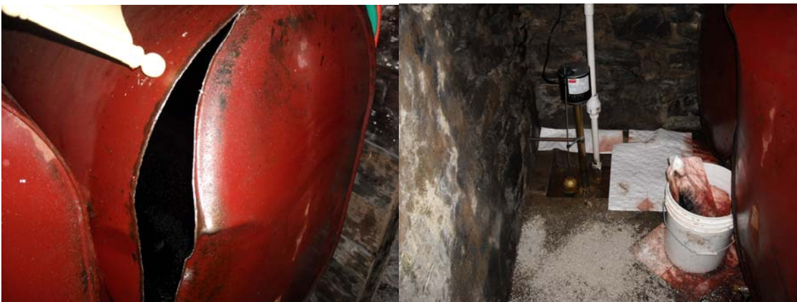
AST failure results in 100 gallon release in Lincoln, VT on January 5, 2009

In 2004, the Legislature extended coverage to homeowner heating oil tanks and enacted a fee on heating fuel to create a revenue source for the heating oil related activities covered by the PCF. The PCF was also divided into two separate accounts: a motor fuel account and a heating oil account, with both revenue and expenditures to be managed within each account.