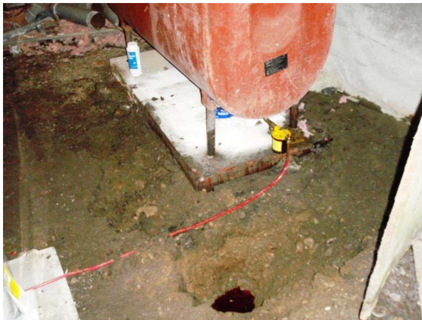
100 gallon release from AST in Waterbury on May 26, 2009

The sunset date for collection of the motor fuel and heating fuel fees is April 1, 2016.