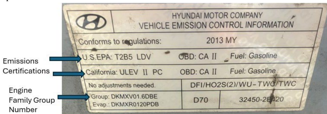
Figure 5: Interpreting your VECI label