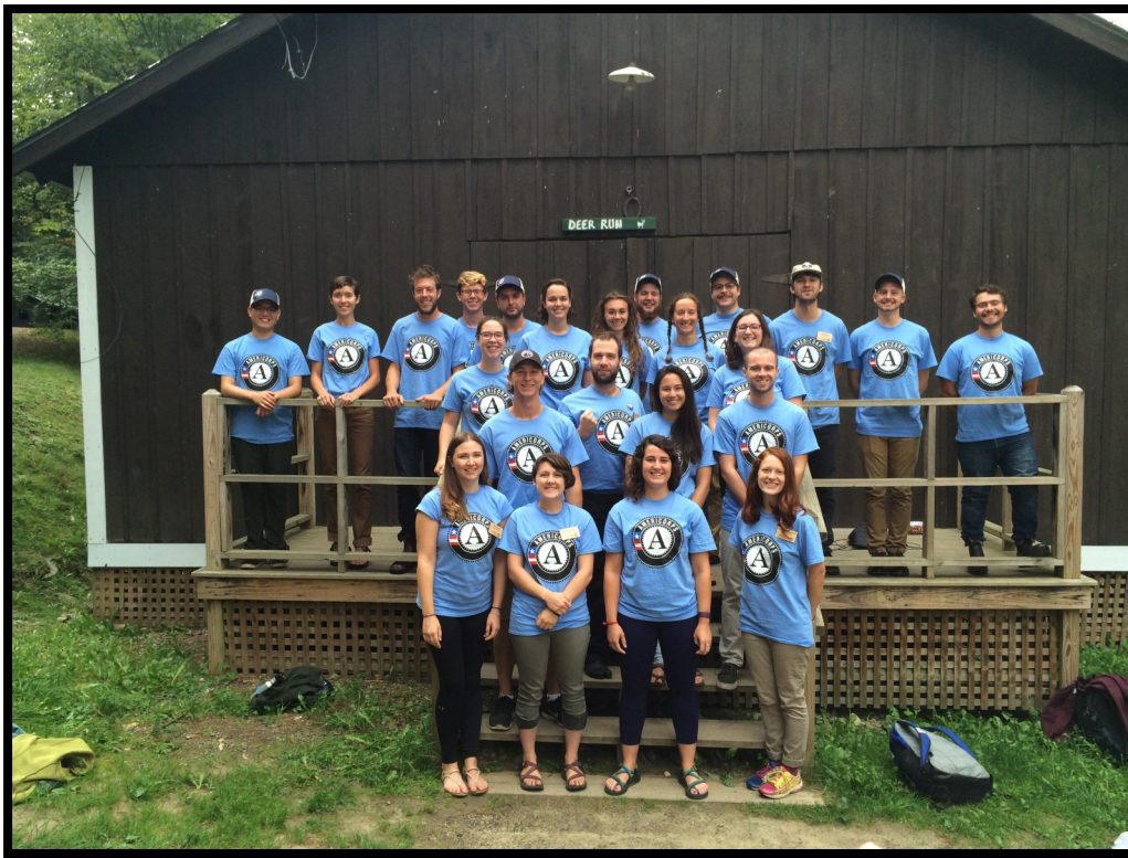
2016 -2017 Members at orientation