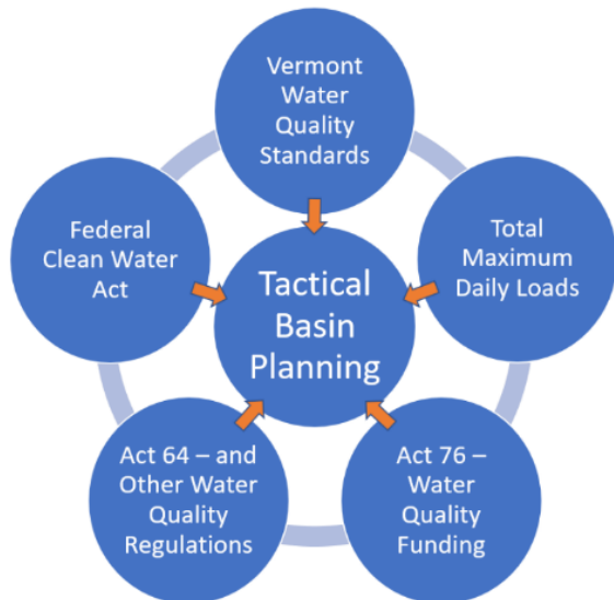
Figure 1. Policy requirements of Tactical Basin Planning.

A Tactical Basin Plan (TBP) is a strategic guidebook produced by the Vermont Agency of Natural Resources (ANR) to protect and restore Vermont's surface waters. The agency develops these watershed plans for each of the 15 major basins in the State of Vermont. TBPs target strategies and prioritize resources to those actions that will have the greatest influence on surface water protection or restoration.