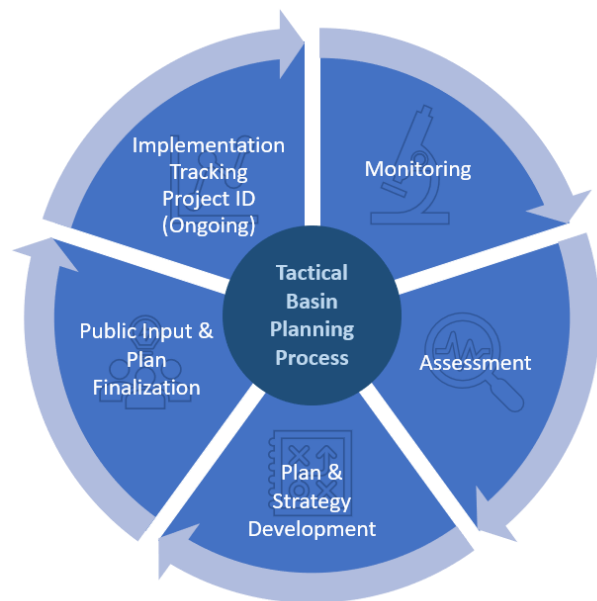
Figure 2. Five-year basin planning cycle.

TBPs are integral to meeting a broad array of both state and federal requirements including the U.S Environmental Protection Agency's 9-element framework for watershed plans (Environmental Protection Agency, 2008) and state statutory obligations including those of the Vermont Clean Water Act, and 10 VSA § 925 and 10 VSA § 1253 (Figure 1).