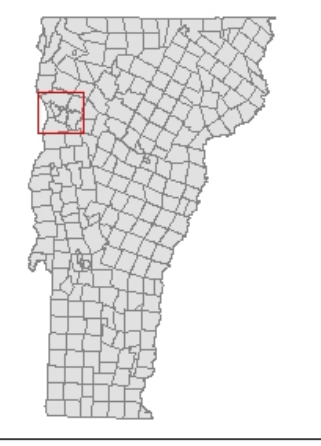
Figure 1: Bartlett Brook Stormwater Impaired Watershed