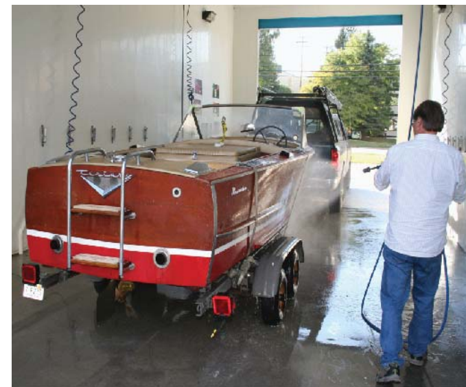
Checkerbay Car Wash, Colchester, VT