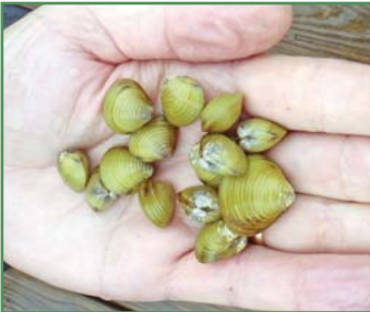
Asian clams have raised concentric ridges unlike any native to the region.

12 Treadway Car Wash 1203 NYS Route 9N, Ticonderoga, NY (518) 585-2103 Water Temperature: 70-80 °F Water Pressure: 1200 PSI Timed Wash Length: 4 mins