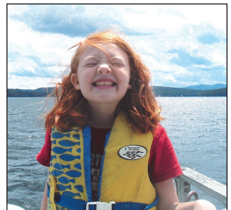
Lakeshore conservation benefits people of all ages who enjoy the recreational opportunities that lakes offer.