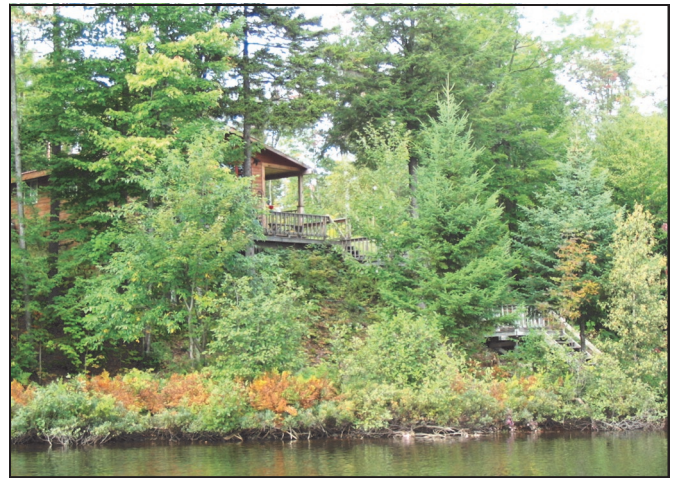
Conserving your shorefront for the long-term ensures that the efforts you make to protect, restore or enhance your lakeshore will continue into the future.