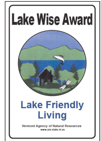
Conserving your "Lake Wise" shorefront ensures long-term quality.