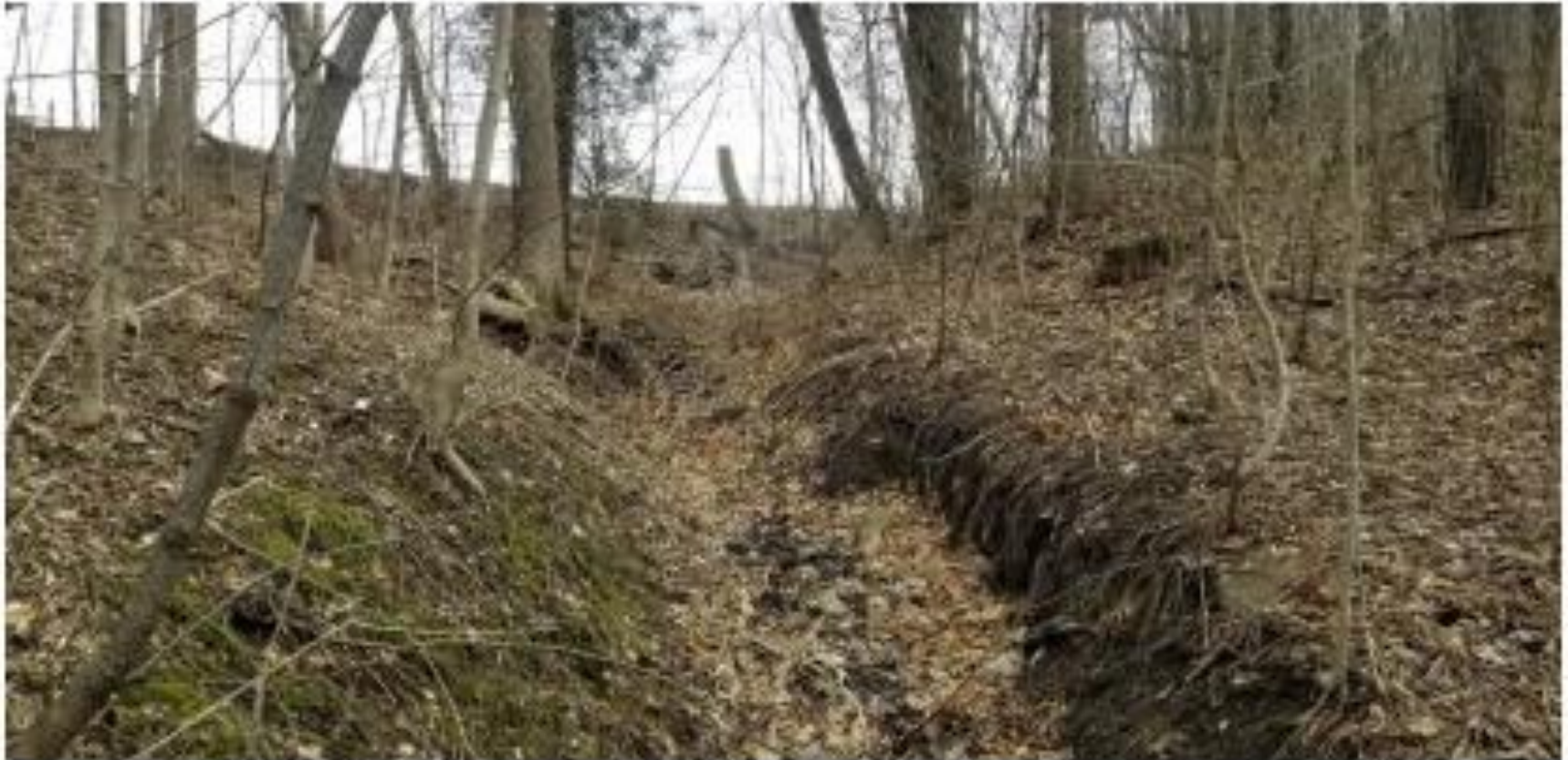
Figure 14. An eroding gully has formed south of Mill River Road.