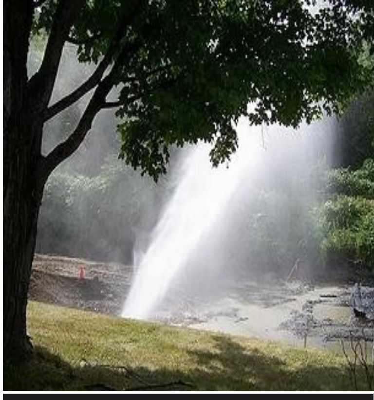
Water main break in Montpelier, VT (August 2011)

Check out the Asset Management Guidance and Planning Loan opportunity on our website. The guidance includes information on: